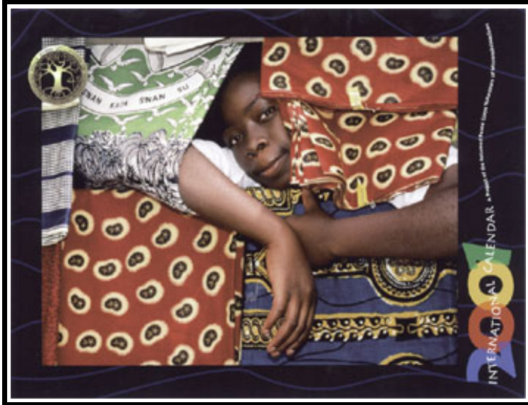
Cover Photo -2001

Since 1987 the RPCVs of Wisconsin-Madison have been producing and distributing one of the finest quality calendars on the market - the International Calendar . This year the calendar is available through Friends of Niger . The calendar is open size, 12 1/4" x 18 3/4", features 13 color photos along with information from past and present Peace Corps service countries, and is printed with soy-based ink on recycled paper. Each day of the year is annotated with holiday and event information; each month includes information on lunar and celestial events; and each photo is complimented by material related to the country portrayed. A photo of the Maradi Grand Marché graces the month of September courtesy of Tori Paide (Niger RPCV '94-'96). The calendars are priced at $12 each, shipping included. Use the FON Membership & Order Form on page 9 or send a check made out to Friends of Niger, along with your name and address to: Calendars, c/o Friends of Niger, P.O. Box 33164, Washington, D.C., 20033-0164.